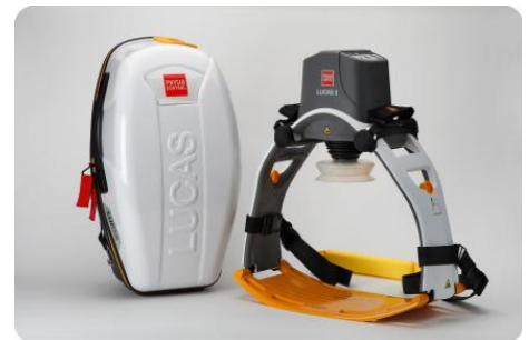
Lucas Chest Compression Device